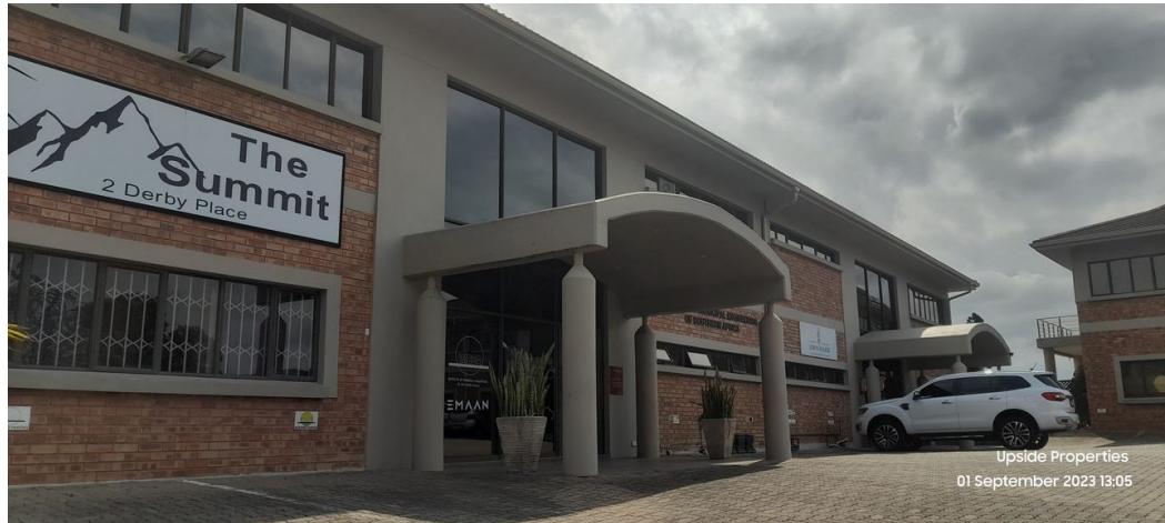
Upside Properties 01 September 2023 13:05

Suite 1 The Corals 7 Campbell Drive Umhlanga 4319